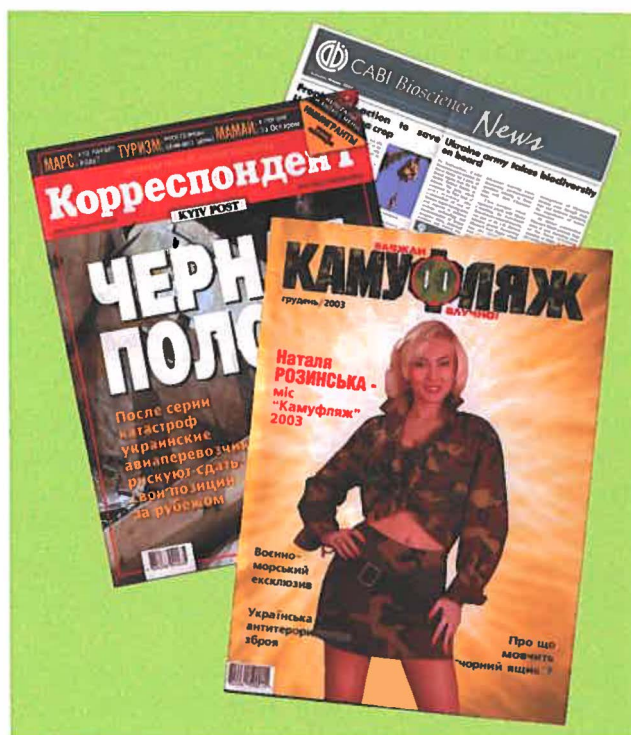
Three of the publications in which articles about this project appeared

Darwin Initiative projects have now operated in Ukraine more or less continuously for over twelve years. With the exception of the so-called "Piontkovsky affair" (mentioned in the section Main Problems and Steps to Overcome Them above), all of the Darwin Initiative's activities in Ukraine have received universally positive publicity. Where the Darwin Initiative is known in Ukraine, and, apart from biodiversity scientists and informed sectors of the general public, that includes some politicians, some ministries, relevant sections of the military, and the Embassy of Ukraine in London, the fund is highly regarded.