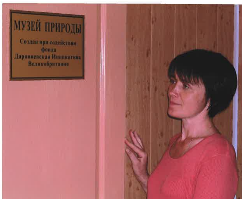
Dr Hayova reads the plaque acknowledging Darwin Initiative support in the new reserve museum at Opuk

Extent to which project achieved goal. The table in Appendix I shows approximately the contribution made by different components of the project to the measures for biodiversity conservation defined in the CBD Articles.