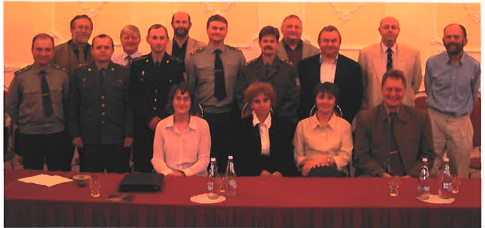
The UK Military Delegation and their hosts, Kiev, September 2004