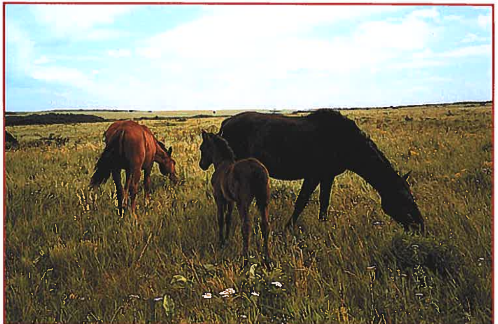
Khomutovski Steppe Nature Reserve: some of the horses used to control scrub encroachment through grazing