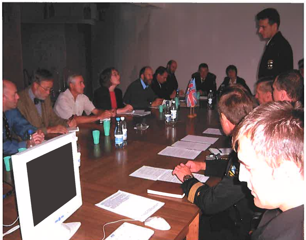
Sebastopol, September 2004, one of the British-Ukrainian military seminars in progress