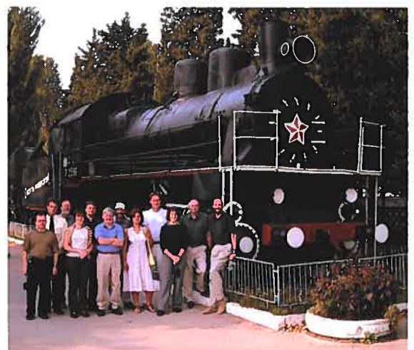
Sebastopol', September 2004: the British military delegation and their hosts in front of an historic military railway locomotive

Capacity building. The original proposal for this project promised capacity building through establishment of a seed bank [for native wild plants] at Nikita Botanic Garden. This was fully achieved, and Dr Isikov now manages and maintains that seed bank. In addition, three other seed banks were established, in Kiev, Poltava and