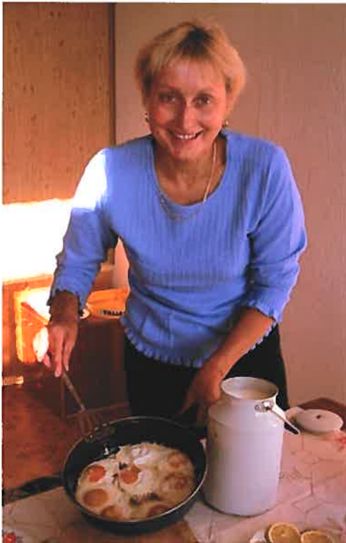
Breakfast in Opuk: one of the village ladies who are now providing "green tourism" accommodation

Collaboration within Ukraine. The project has made a very positive impact on collaboration within Ukraine, through much improved links between the country's military and scientists working in nature conservation, and through establishment of a Crimean Coast Stakeholders' Forum .