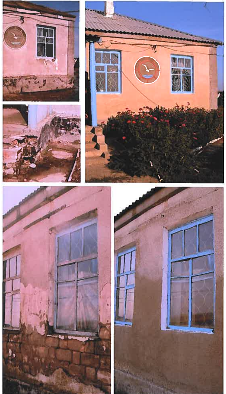
Repairs to the Opuk reserve building: before and after